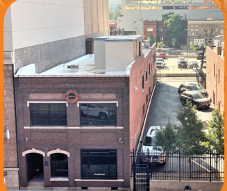
1336 Glenarm Pl.