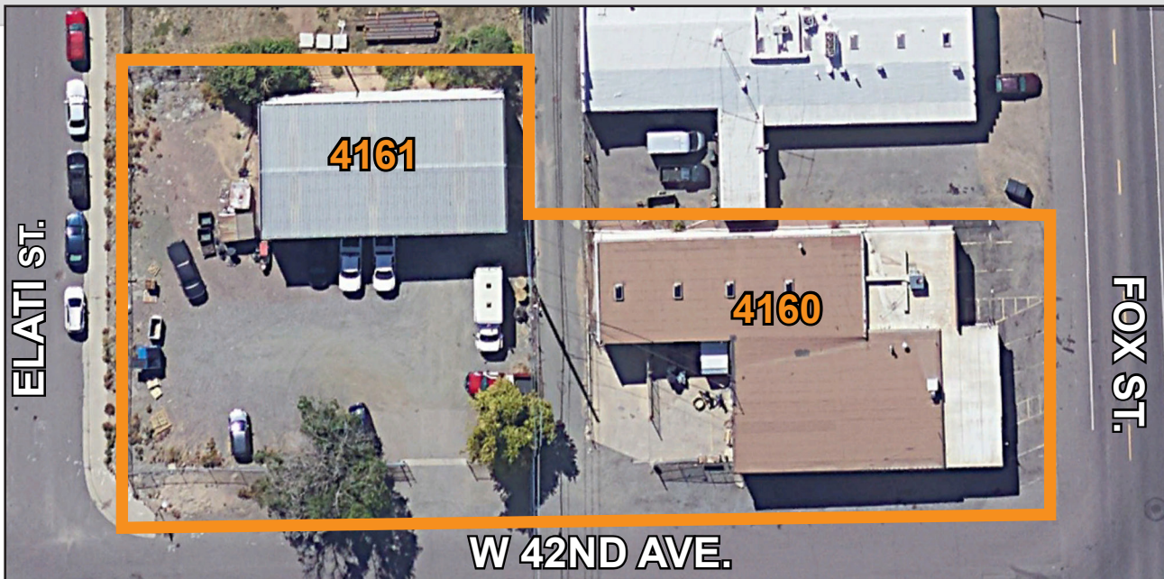
4161 ELATI ST.

4160 Fox St. & 4161 Elati St. Denver, CO 80216