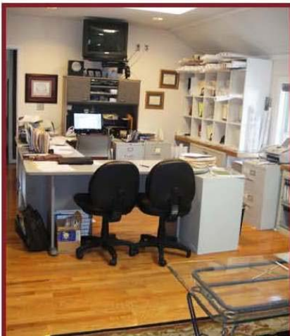
EXECUTIVE OFFICE SUITE