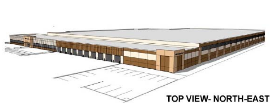
TOP VIEW- NORTH-EAST